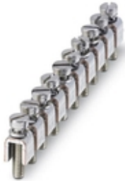
Fixed bridge, pitch: 10 mm, number of positions: 10, color: silver

Please be informed that the data shown in this PDF Document is generated from our Online Catalog. Please find the complete data in the user's documentation. Our General Terms of Use for Downloads are valid ( http://phoenixcontact.com/download )